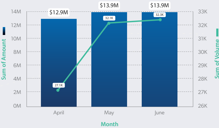
Real-Time Payments Volume and Dollars

RTP transactions climbed steadily in the second quarter of 2024.