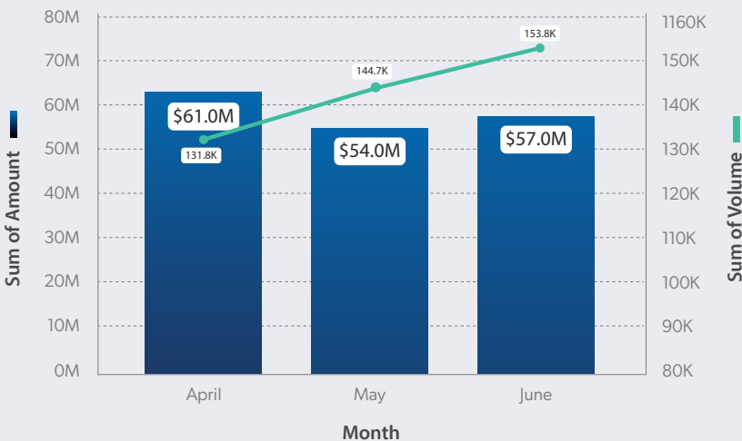
Real-Time Payments Volume and Dollars

RTP transactions climbed steadily in the second quarter of 2025, increasing 30 percent.